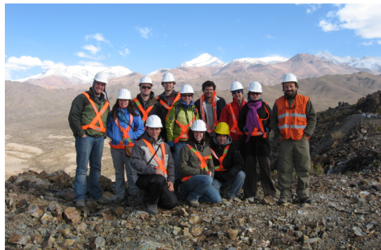
SEG Student Chapter in Argentina (Mai 2010)

We also want to offer two places in the fieldtrip to industry professionals who want to acquire more knowledge about the Bolivian economic geology, its mining environment and the unique geology of an active continental volcanic arc and its actually forming epithermal systems. The chapter provides all the field trip organization and we only ask from the participant a financial support for their participation at the excursion. The approximate price is 5000 $can but it is subject to revaluation depending of the flight tickets and facilities (lodging, transportation) costs in Bolivia. Also note that separate and comfortable lodging is guaranteed for the participating industry professionals.